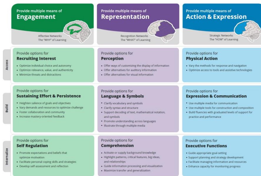
Figure 2: UDL Guidelines (CAST, 2018)

The UDL guidelines, developed and published by the Center for Applied Special Technology (CAST, 2018), will serve as the foundation for the framework analysis. An overview of the framework is depicted in Figure 2.