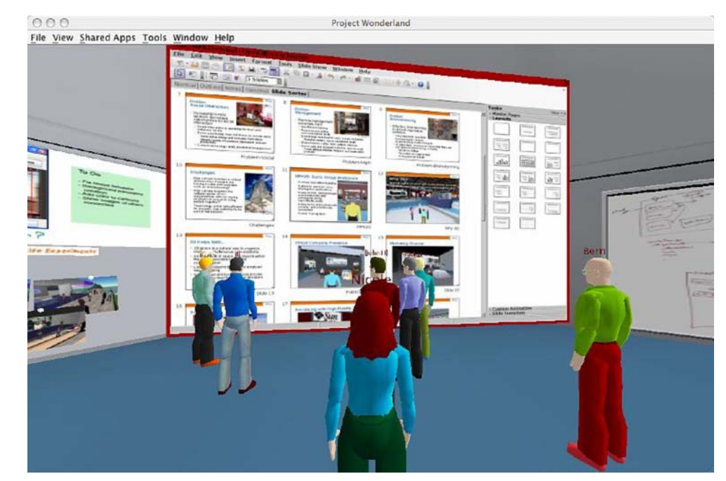
Fig. 3 Discussing presentation slides in Project Wonderland.

Cooperative virtual environments are not entirely new. They have a tradition of (almost) 20 years, starting with the Distributed Interactive Virtual Environment system (Hagsand 1996), which has been continuously developed