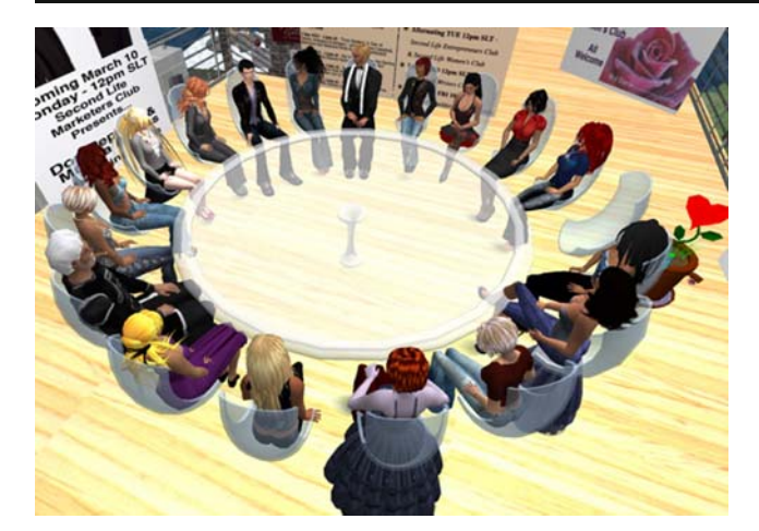
Fig. 2 A round-table discussion in Second Life

valuable as eCollaboration tools. Many of these are related to social factors. For example, Vasalou et al. (2007) have shown that customizable avatars lead to a stronger identification of the users with the avatar and also to a stronger bonding with other participants (as compared to a text chat), which of course is an effect that is welcome in most eCollaboration scenarios.